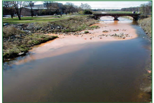
Uncontrolled stormwater, from streets, parking lots, and exposed ground, cause sediment in the waters of the Anacostia Northeast Branch near Riverdale, Md.

While I supported this fund, and I believe it will help push the County forward on economic development, I wanted to ensure there will be proper oversight and that checks and balances are safeguarded. The County Executive proposed that an independent panel of financial professionals will scrutinize each deal, and will be empowered to do the fiscal analysis regarding what deals would make a wise investment. However, the County Council also has a fiduciary responsibility and must ensure that taxpayer money is well spent. We worked through the details of the EDI Fund with the County Executive to ensure proper safeguards and oversight, while removing politics from the process and retaining the necessary flexibility for consummating big economic development deals. The Council also pushed the direction of the bill to focus the funds more toward investment in redevelopment and revitalization - including transit-oriented development - so that the County is not spending taxpayer money to help finance sprawl outside the Beltway. I believe that properly managed, and by making wise investment decisions, the use of these funds will pay off for the County many times over by creating a more robust local economy that diversifies and expands our tax and jobs base.