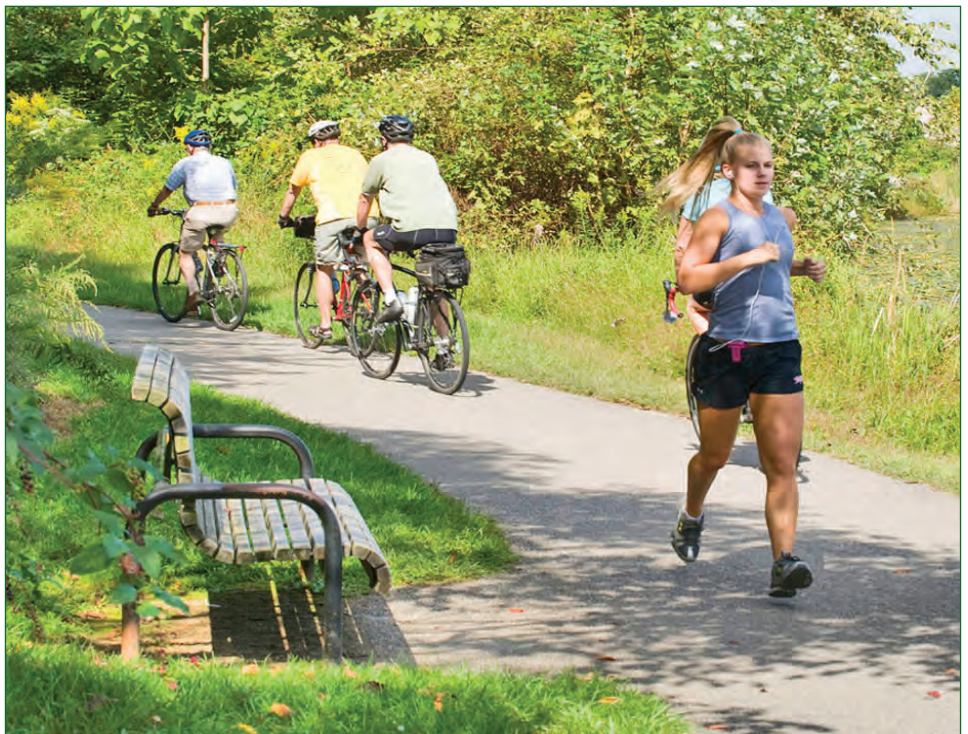
Residents enjoy the trails at Lake Artemesia.

This spring, a trail will be built from the end of Nevada Street in