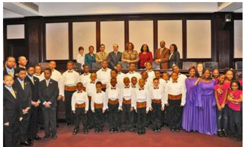
Prince George's County Council Members stand with student participants at the 7th Annual Black History Month Program, Art and Soul: Celebration of the Arts in Prince George's County, March 1, 2011.